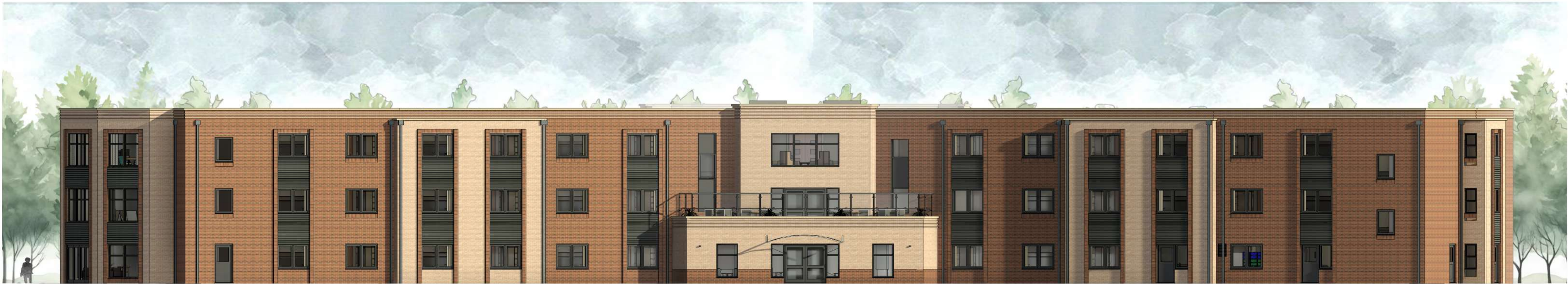
WEST ELEVATION 1 : 150