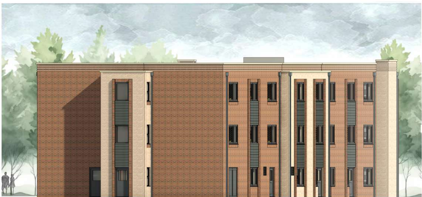
SOUTH ELEVATION 1 : 150