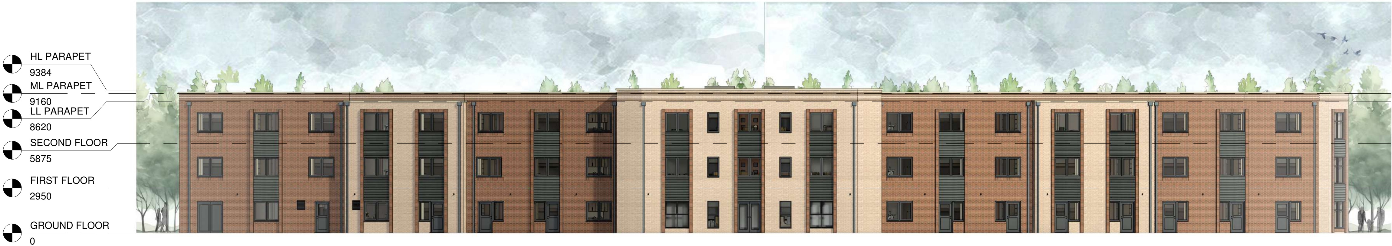
EAST ELEVATION 1 : 150