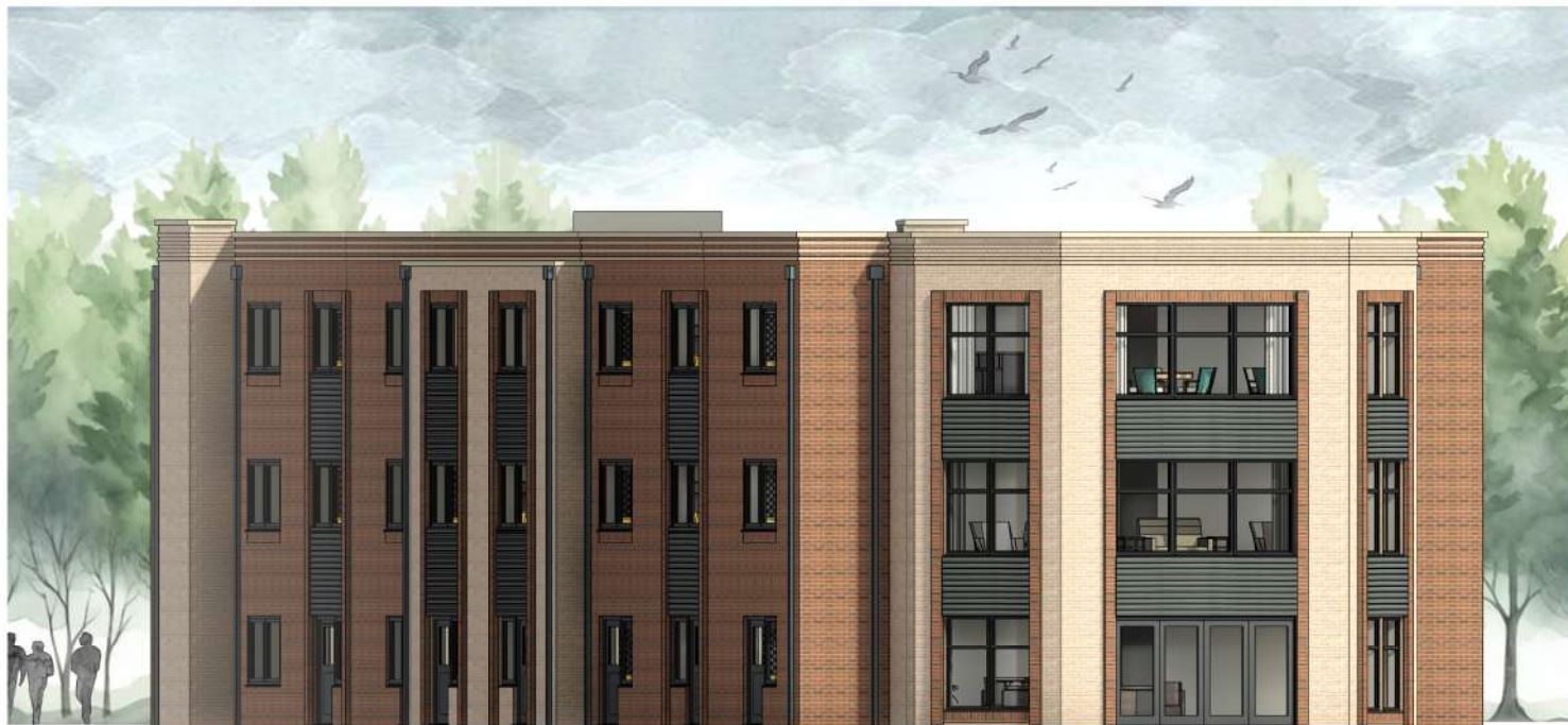
NORTH ELEVATION 1 : 150